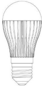
Design E26/27 (EURO)