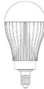
Design E14 (US)