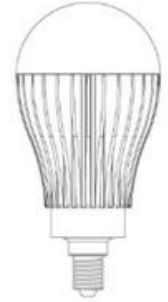
Design B22D (EURO)