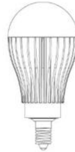
Design E14 (US)